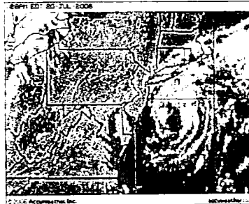
The accuweather.com satellite image from Tropical Storm Beryl as it passed off the Jersey Coast, Thursday July 18, 2006.